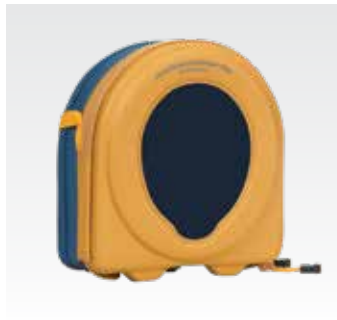
HeartSine AED Carrying Case PAD-BAG-01 11516-000022