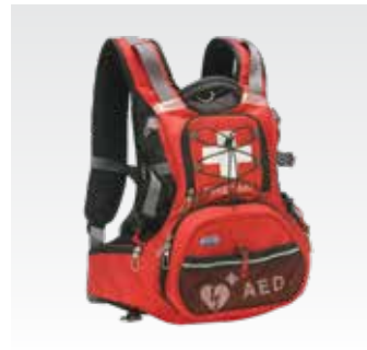
Mobile AED Rescue Backpack PAD-BAG-02 11516-000114