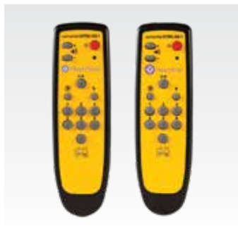
HeartSine samaritan PAD Trainer Remote TRN-ACC-16 (SAM 350P) 11516-000014 TRN-ACC-18 (SAM 360P) 11516-000016