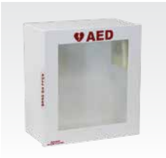
Wall Cabinet with Alarm, Custom Made Dimensions: 30.48 H x 27.94 W x 12.7 D cm (12 H x 11 W x 5 D in) Weight: 2.27 kg (5 lb) PAD-CAB-04 11516-000024