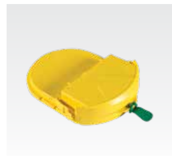
Trainer-Pak (Replacement Electrode Cartridge)