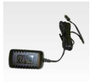
Battery Charger (Replacement) TRN-ACC-14 11516-000012