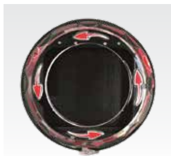
Rotaid Plus Wall Cabinet with Alarm For indoor use.

11996-000442 (Green) 11996-000441 (White) 11996-000443 (Red) 11996-000444 (Yellow)