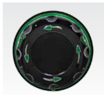
Rotaid Solid Plus Wall Cabinet with Alarm For indoor or outdoor use.

11996-000442 (Green) 11996-000441 (White) 11996-000443 (Red) 11996-000444 (Yellow)