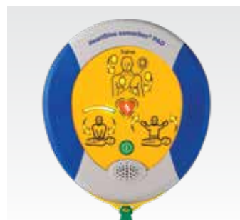
HeartSine samaritan PAD Trainer SAM 500P