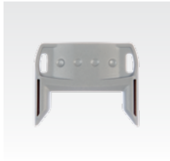
HeartSine Gateway Removal Tool ACC-REM-GW