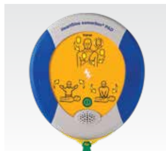
HeartSine samaritan PAD Trainer SAM 360P