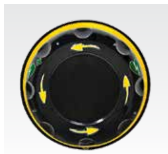
Rotaid Solid Plus Heat Wall Cabinet with Heat and Alarm For outdoor use.

11996-000446 (Green) 11996-000445 (White) 11996-000447 (Red) 11996-000448 (Yellow)