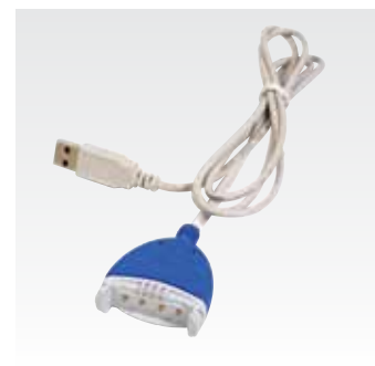
USB Data Cable For use with the Saver EVO™ data management software to download event data and to perform software upgrades to the HeartSine samaritan PAD non-connected devices.