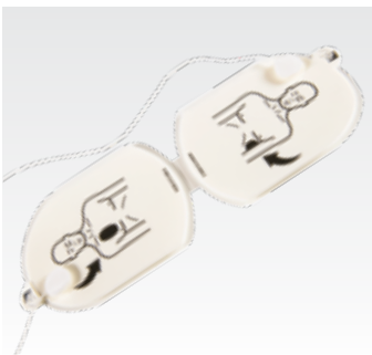
Replacement electrodes (for use with Trainer-Pak) TRN-ACC-02 (10/pak) 11516-000009 TRN-ACC-03 (25/pak) 11516-000011