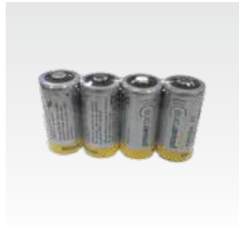
HeartSine Gateway Batteries ACC-BAT-GW