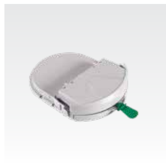
Adult Pad-Pak With TSO-C142a certification for use on aircraft.