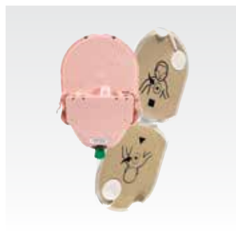
Pediatric-Pak™ For patients 1 to 8 years or up to 25 kg (55 lb).