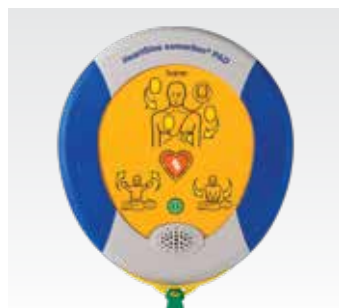
HeartSine samaritan PAD Trainer SAM 350P