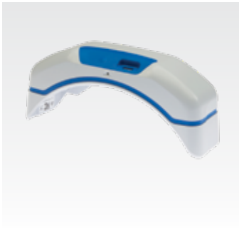
HeartSine Gateway Includes removal tool, batteries and HeartSine Connected AED carrying case. ACC-GTW-XX*